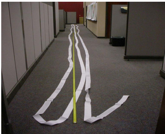
One complete VVPAT tape placed along the Cobb County Election office floor. Approximately 194 feet long (95 ballots).