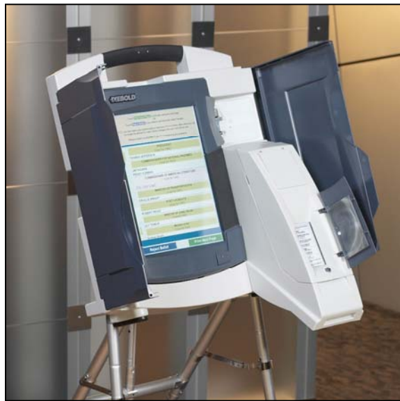
Figure 1: Diebold AccuVote TSX with AccuView Printer Module Attached